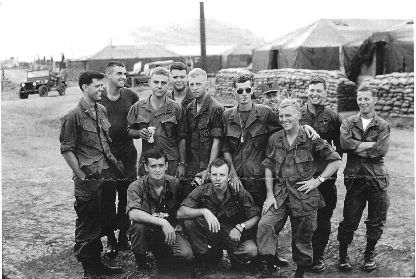
B Troop weapons platoon pilots about November 1967 Camp Enari